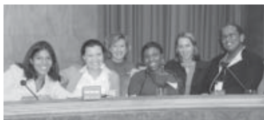
Above left: Future US Senators from Virginia Tech practice passing family policy in Senate Hearing Room 342, Dirksen Senate Office Building.

Copyright © 2003 National Council on Family Relations. All rights reserved.