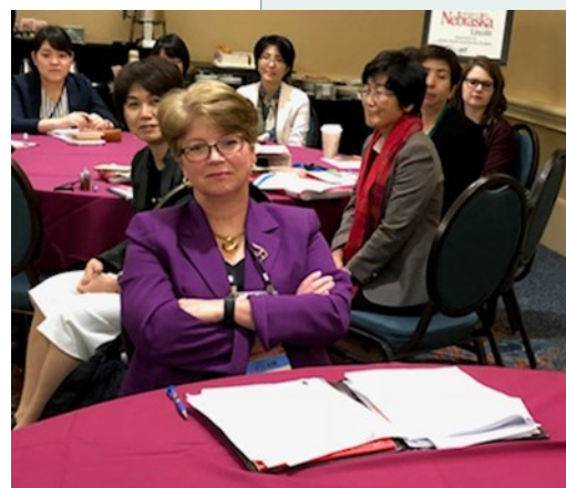
Colleagues at the International Section Business Meeting at NCFR Conference 2017