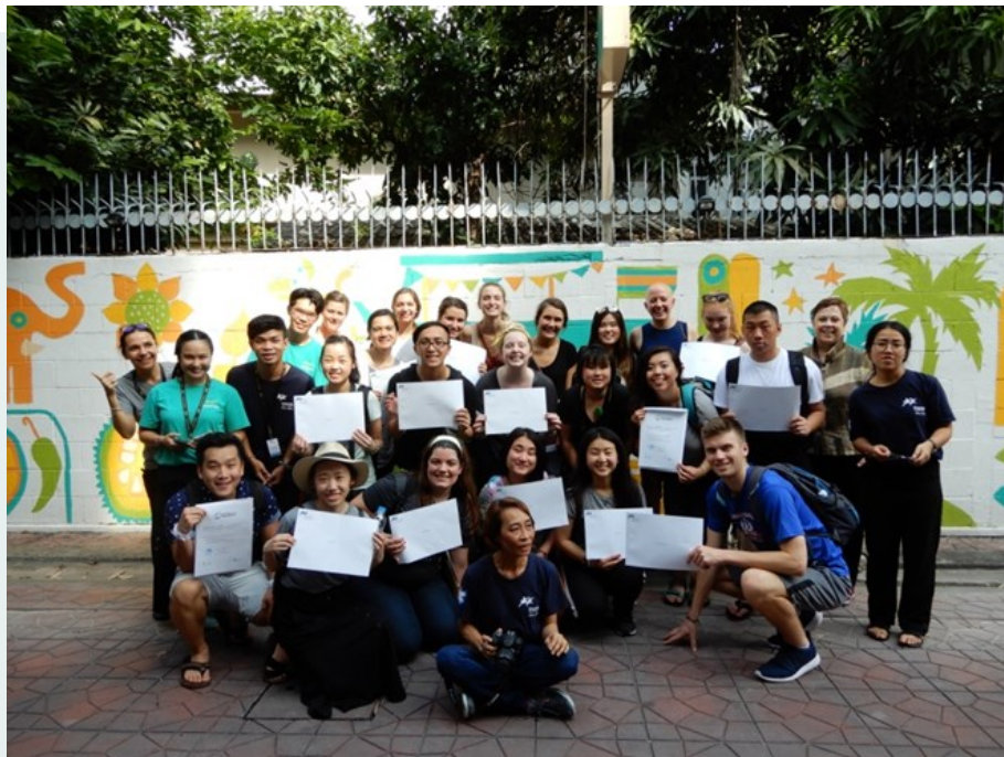
Study Abroad in Thailand, 2017